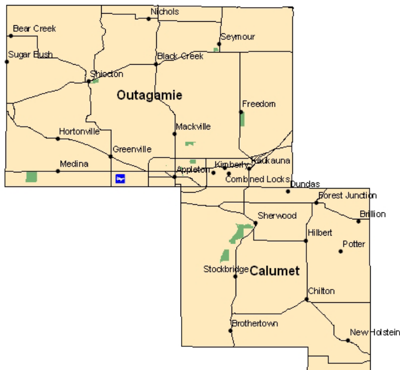
Figure 1. Appleton MSA

The local economic benefits generated by this level of home construction activity are reported in a separate NAHB document. 1 This report presents estimates of the costs—including current and capital expenses—that new homes impose on jurisdictions in the area and compares those costs to the revenue generated. The results are intended to answer the question of whether or not, from the perspective of local government, residential development pays for itself.